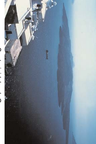
Santorini Island, Greece

October 4, 2004 November 4, 2004 February 15, 2005