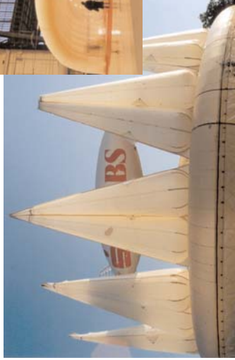
Airship hangar, Stuttgart