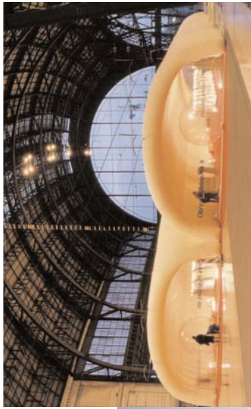
Exhibition at Barcelona train station

http://congress.cimne.upc.es/membranes05